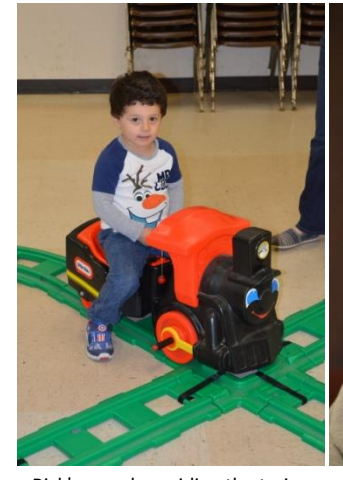
Rick's grandson riding the train